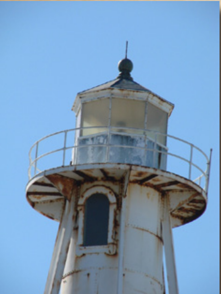
Light tower unsafe Windows boarded up