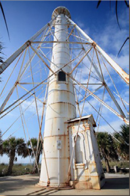
Structural advanced rust