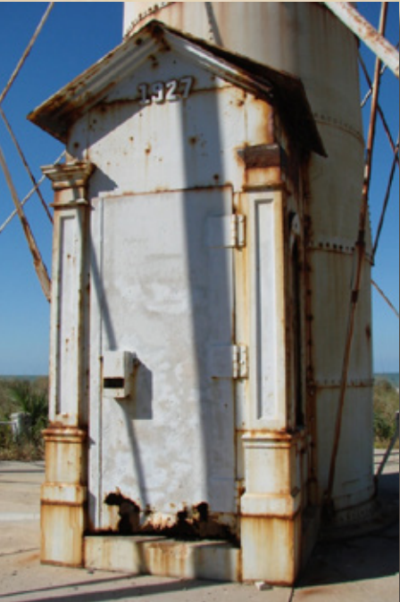
Entry door impassible