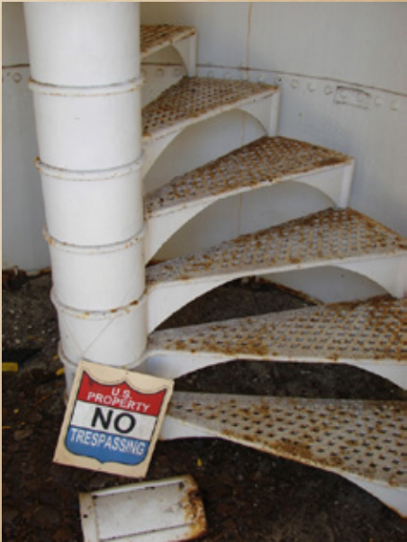
Access stairs high risk