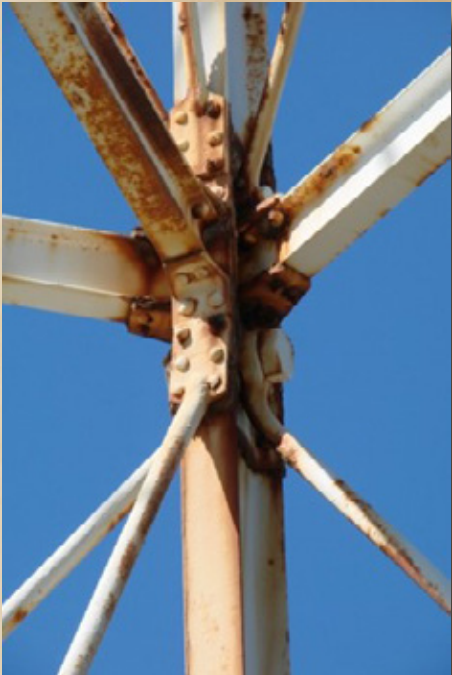
Support joints weakening