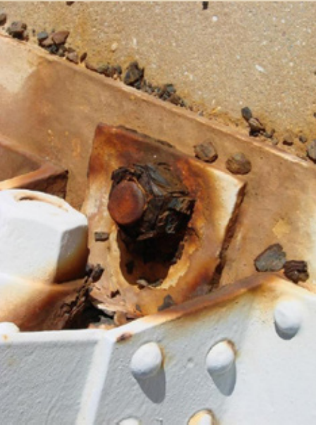
Hundreds of rivets dissolving